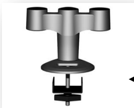
← Grommet Mount

Our dual arm grommet mount provides added stability; will fit standard grommet holes.